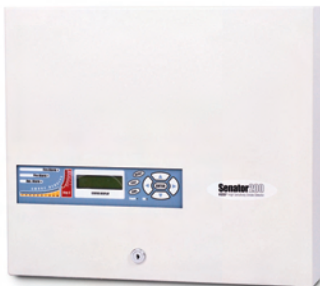
Senator 200 detector - steel enclosure Part No. 30706-KID