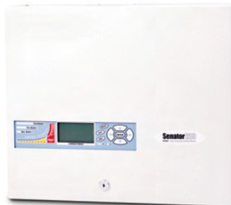
Senator 200 detector with command module - steel enclosure Part No. 30707-KID