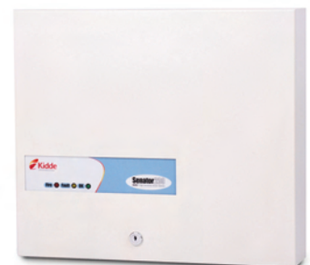
Senator 200 minimum display Part No. 30710-KID