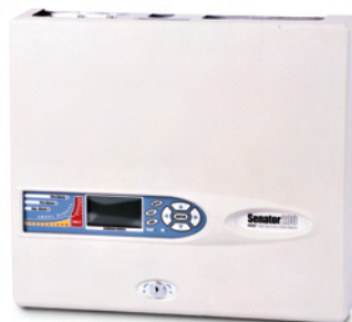
Senator 200 detector with command module Part No. 30620-KID