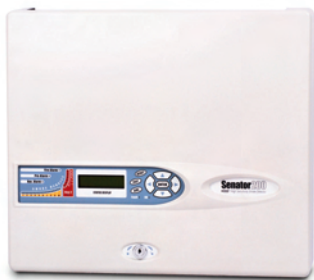
Senator 200 detector Part No. 30621-KID